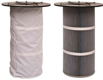
Conductive Aluminized Spun Bond Reverse Purge Cartridge (shown with and without optional skirt) - Included