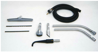
Ø1.5" (Ø38mm) Static Dissipative Tools and Accessories - Optional