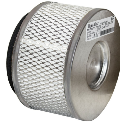
ULPA Filter - Included