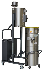
CD/EUR-36L EX DT (MRP) ULPA with Recovery Tank and Filter Chamber removed