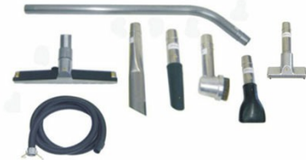
Ø2" (Ø50mm) Static Dissipative Tools and Accessories - Optional